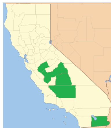
Figure 2: Location of the five leading alfalfa producing counties in California [6] [6] Error! Reference source not found.

Alfalfa is produced across the state from the low desert in the south to the northern intermountain region [6] . However, most alfalfa is produced in Southern California and the San Joaquin Valley. In 2007, 47% of the state's alfalfa acreage was located in the San Joaquin Valley and 25% in Southern California [6] . The counties with the largest area are Imperial, Kern, Merced, Tulare and Fresno (Figure 2). Roughly half of California's alfalfa acreage can be found in these five counties.